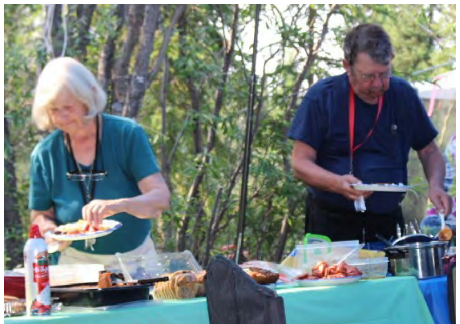
One of many potluck dinners at Motley